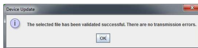
Figure 1: Update tool: - successfully validation of the firmware image